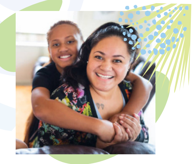
"It takes a village to raise a child. 'Ohana Resiliency Support Services brings the village together and supports our family to lead my teenager towards success." IM (mother)

Oʻahu – 808.589.1829 Ext. 600 91-1259 Renton Road ʻEwa Beach, Hawaiʻi 96706